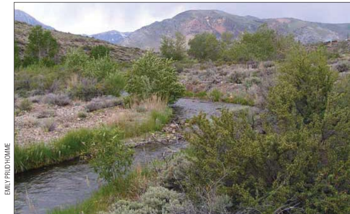
Looking upstream at Mill Creek.

from Mill Creek for irrigation caused the Mill Creek bottomlands to dry up frequently. By 1929, when the first aerial photos of Mono Lake were taken, natural Mill Creek was already greatly diminished. A once expansive bottomland forest could now be counted only in linear feet along the stream rather than in acres, as evidenced by the many dead trees visible where the forest had once flourished.