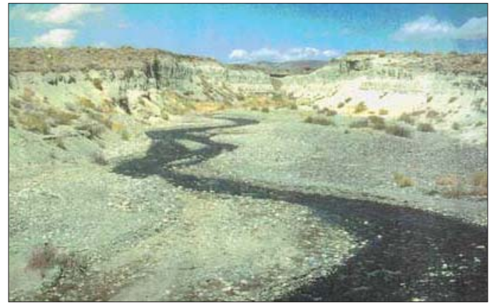
Wilson Creek's "grand canyon".