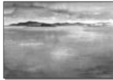
Before the Rain, 1930