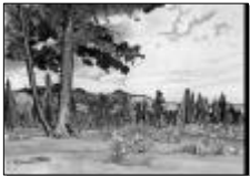
Morning at Mono Lake, 1930