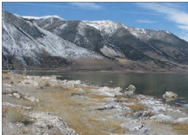
February 28, 2018: A total of 4.6 inches of snow fell last February, leaving just a dusting of snow on the mountains. The season to date was 8.8 inches, and the season total was 27.2 inches.