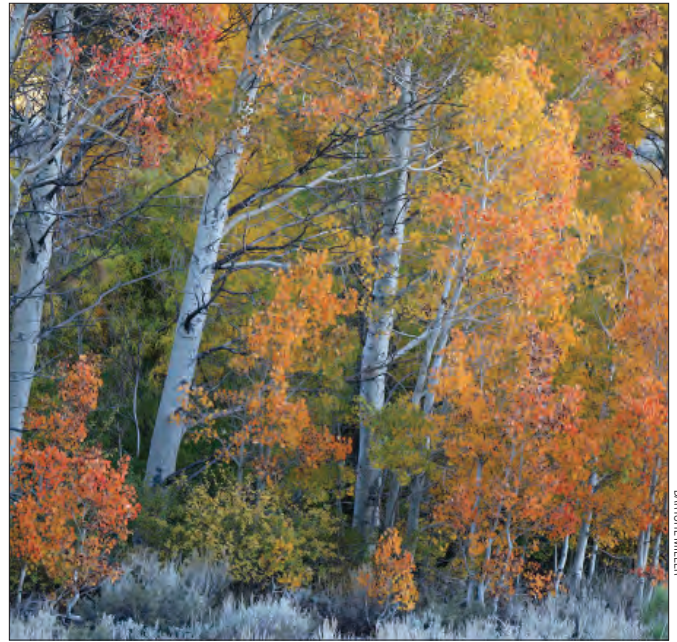
In autumn, quaking aspen trees light up Mono Basin canyons with hues of gold.

In autumn spectacular foliage and skies combine with exceptional light, presenting ample subject matter to photograph. Explore shoreline locations at sunrise and sunset,