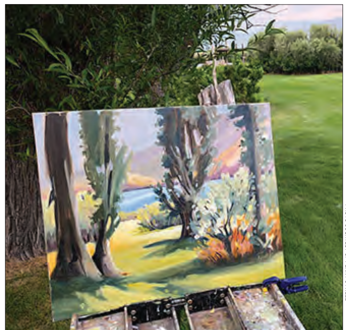
Painting en plein air allows an instant connection with the landscape.

During this seminar, participants will prepare materials and create a small Miwok-Paiute basket using a twining method. This seminar is designed for weavers of all levels and participants are encouraged (but not required) to camp with the group at a peaceful private campsite near Lundy Canyon.