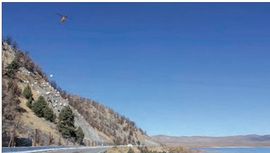
As part of the Rockfall Project Plant Establishment Program, large bags of pine needle mulch were delivered by helicopter to the slopes in late 2017 to aid in revegetation.

Late last year, Caltrans introduced three shoulder widening projects in Mono County, one of which is in the Mono Basin at the bottom of Conway Summit. The Conway Ranch Shoulder Widening Project proposes to widen shoulders along Highway 395 from Highway 167 north to the bottom of