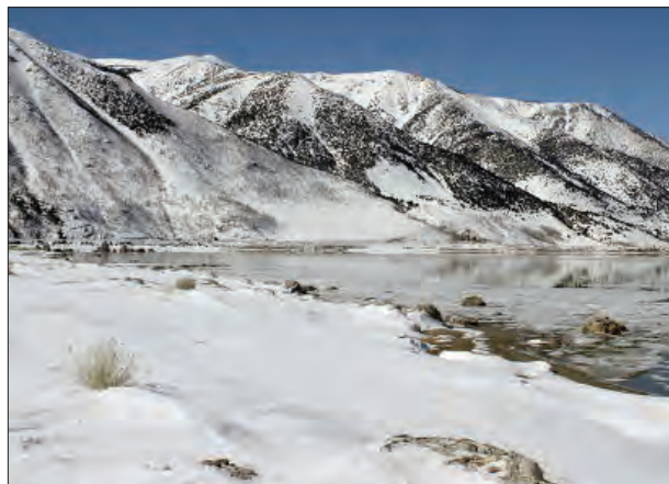
February 22, 2019: After 52.8 inches of snow in February, the Mono Basin is covered in white from the highest peaks to the shores of Mono Lake. Season to date: 90.2 inches.