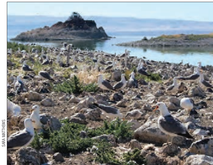
California Gulls need open areas for nesting, like the habitat shown above in 2016.