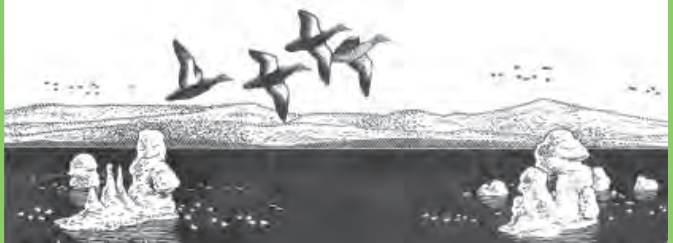
CARL DENNIS BUELL

free training takes place May 31-June 2 sign up by calling (760) 647-6595