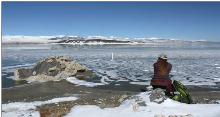
Regular reading of the lake level gauge is a whole new adventure during snowy winters, and is especially fun when the only way to get there is on skis.

2019, Mono Lake will rise. How much? It depends on when the barrage of snowstorms stops. ❖