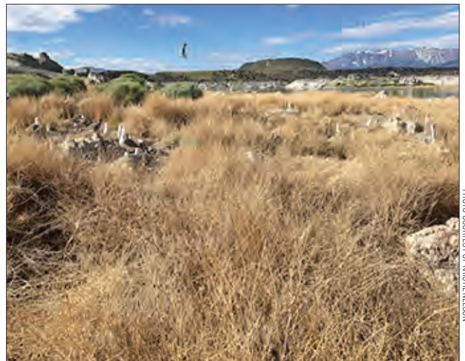
By 2018, Bassia hyssopifolia had spread rapidly on the Negit Islets, significantly reducing California Gull nesting habitat.