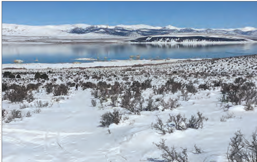
COVER PHOTO BY ANDREW YOUSSEF