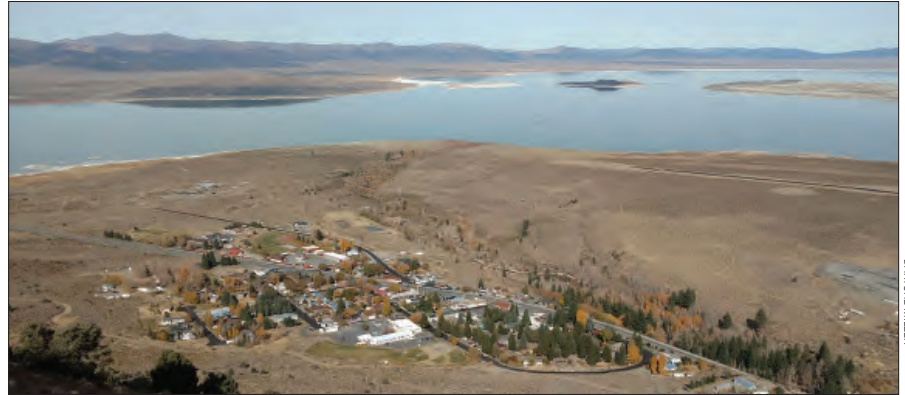
Plans for the Caltrans Rehab Project include significant amenities for the town of Lee Vining, such as upgrading sidewalks and drainage, replacing pavement, and improving safety.

While the in-town section allows for significant transportation amenities on which the community has provided initial input, Caltrans has been less clear regarding design possibilities for the section along the west shore of Mono Lake. The Mono Lake Committee is reaching out to Caltrans before the completion of the Project Initiation Document in anticipation that the success of the recent Rockfall Project (see following note) achieved transportation goals and protected environmental and scenic values along the west shore of Mono Lake, and the Committee will propose a similar