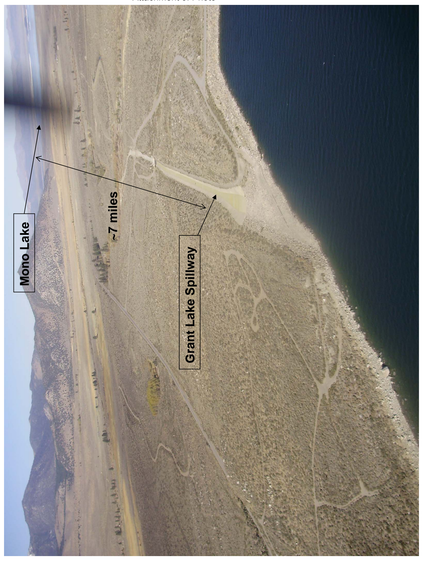
Attachment 3. Photo